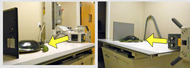
Positioning for AP view